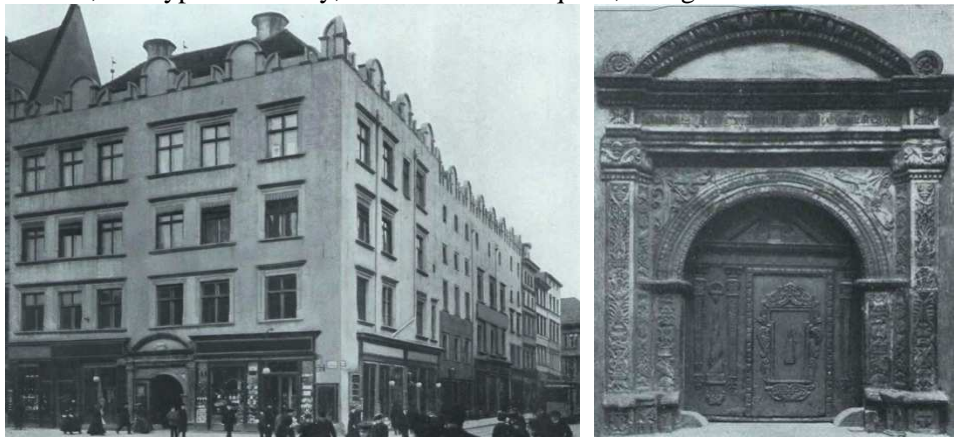
Fig. 1a, 1b. Building "Zur goldenen Krone" and its portal by the end of XIX c

stand-alone entrance to the service, and then also the higher floors. At the end of the century, due to the huge demand for commercial space in the area of Market, this type of activity, became far inadequate, though.