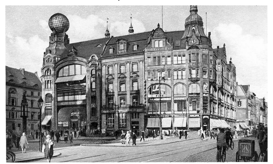
Fig. 3. Commercial property of eastern frontage of the Market, from the left: "Werenhaus Barasch", "Breslauer Disconto-Bank", "Geschäftshaus zur goldenen Krone", 1905