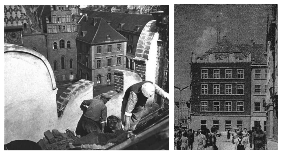
Fig. 5a i 5b. Roofing in 1960 and southern elevation in 1961

On the reconstruction one decided to use reduced to four-storey steel frame of the former department store (within the roof one preserved part of the fifth floor). Corner fragment was given a form inspired by the architecture previously described Renaissance building. Facade wall was added in front of the structural columns (four from the Market and six from the Oławska street). From the Market, in a 3-storey, 5-axial facade windows on the upper floors were grouped of two and three, stringing with cornices on the lines of windowsills and above the lintels. From the Oławska street, four axes of equally spaced windows were combined in a similar manner (Fig. 4b). In the rusticated ground floor from the Market, one built in moved from another house renaissance portal, and in axes of epper floors, one placed showcased windows. At the corner above the plinth ledge, one built in, referring to the name a ceramic crown. Both facades were crowned with continuous parapet modeled on historical one(Fig. 5a). Another part of the building along the Oławska street was slightly withdrawn and treated as a separate object. The facade was symmetrical, 16-axial (nine of which were within the preserved skeleton) looked contemporary, but had the same number of floors, aligned levels, identical windows and dipped roof. Commissioned in 1961 to use building at that time was quite a luxury; it had central heating and a lift, one even planned an underground garage (Fig. 5b).