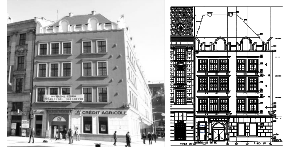
Fig. 6a, 6b. Market 29 building remodeling project - Oławska 2. Facade of Market ,Kirschke Design Studio, 2013 Building "Under the Crown", the state of 2014